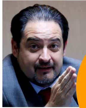
MR. ANDRÉS REBOLLEDO Chilean Energy Minister

By October 2017, Chile had exceeded all expectations, with an encouraging pipeline of 31 renewable energy projects declared under construction. By March 2024, these projects are expected to inject at least 1926 MW to the grid. Moreover, 91 renewable energy projects were under environmental evaluation as of June 2016, equivalent to 8,815 MW and USD 25,677 million investment. During 2016, the government assigned over USD 9 million of the public budget to promoting the development of renewable energy projects.