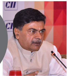
MR. R. K. SINGH Union Minister of State (I/C) for Power, and New and Renewable Energy

"India is confident about achieving its renewable energy targets. Efficiency of solar panels has increased to 30% and it will increase further - that is the future."