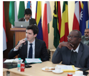
Country Intervention: France