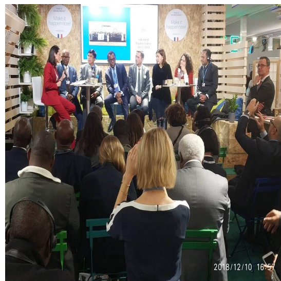
H.E. Brune Poirson, Minister of State, France presenting concluding remarks at ISA Session in France Pavilion during COP 24

The ISA is one of the tools to achieve this. France wants the ISA to become the showcase of what we can do for tomorrow.