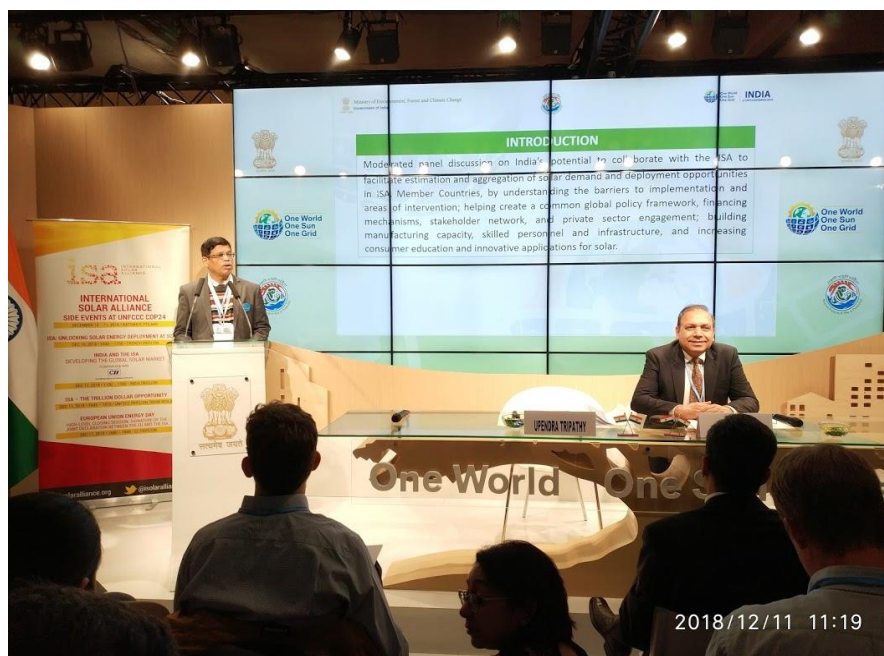
DG ISA addressing the audience In India Pavilion at Katowice, Poland

Recalling that the ISA initiative is the vision of Hon’ble Prime Minister of India Shri Narendra Modi, H.E. Anand Kumar, Secretary, Ministry of New and Renewable Energy, Government of India reaffirmed Indian Government’s continued support for the ISA. H.E. Prime Minister Modi set up the vision in October 2018 at the inauguration of the ISA First Assembly: “One world, one sun, one grid”. ISA is the major initiative for implementing the Paris Agreement. Shri Kumar also spoke about the Government plans to increase the share of renewable energy in India’s energy mix, especially towards achieving cumulative installed renewable power capacity of 175GW by 2022.