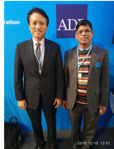
Director General, SDCCD, ADB & DG ISA

ADB has 16 common countries with ISA. It is coming with a 2M USD fund for ISA to be announced in 2019. In the TA component of the fund, it is planned that the focus will be on i STAR-C project in the Pacific island countries. Discussions were also held to plan a side event on this topic during the Assembly of ADB in Fiji 2-5 May 2019 and during the ADB Clean Energy Forum in Manila on 17- 21 June. ADB also showed interest in developing projects in ISA Member countries under the High Level Technology Fund the bank has institutionalized with Japan recently.