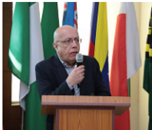
Ambassador Peru updating the participants about SunWorld 2019