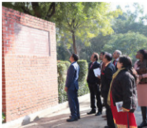
DG ISA along with visiting dignitaries; trip to NISE facilities