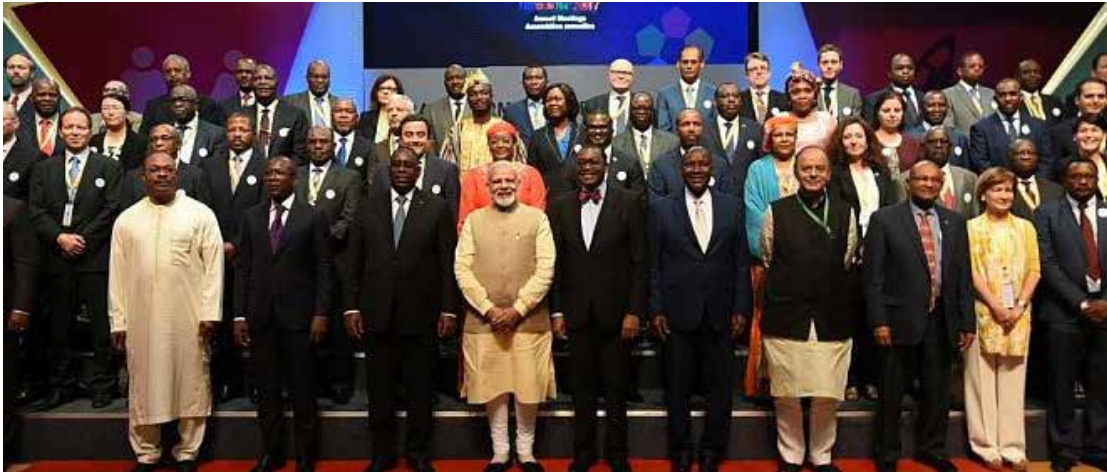
President of the AfDB Group, Hon'ble Prime Minister of India, and other senior dignitaries from African countries inaugurated the exhibition, organised as part of the 52 nd annual meeting of the African Development Bank (AfDB) held in Gandhinagar, Gujarat, India