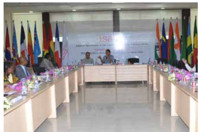
▲ First get-together of the Contact Points of the ISA Prospective Member Countries in May 2017