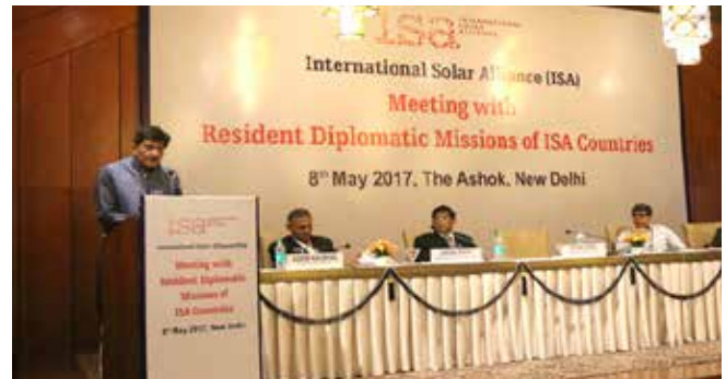
▲ Hon'ble Indian Minister of State for Power, Coal, New and Renewable Energy, and Mines, Shri Piyush Goyal addresses the Diplomatic Missions of ISA Countries on 8 May 2017 in New Delhi, India

ISA has charted its way forward on a number of other fronts as well. A study on Common Risk Mitigation Mechanism has been commissioned, with support from 13 countries and with an aim to develop a tool for the creation of a more secure environment for private investment in solar assets in member countries. ISA has also granted Observer Status to both the International Renewable Energy Agency and the International Energy Agency. This is another major step forward for ISA in collaborating with other international organisations to take work on common identified areas forward.