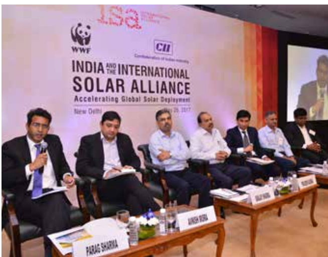
◀ The International Solar Alliance, in partnership with the Confederation of Indian Industry (CII) and World Wildlife Fund - India organised a workshop on 'India and the International Solar Alliance: Accelerating Global Solar Deployment' on 26 May 2017 in New Delhi.