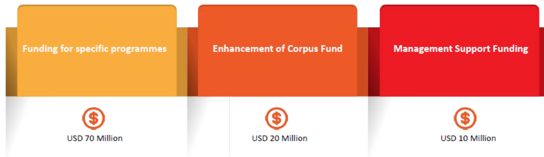
Figure 2 Funding requirement of ISA to implement programs in the next 3 years

Details of each of these requirements are given below: