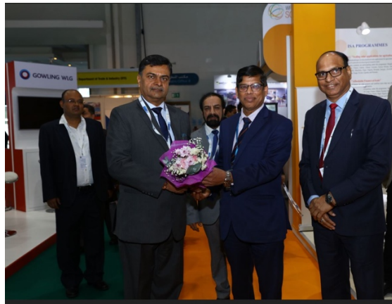
DG, ISA WELCOMING HON'BLE MINISTER FOR POWER AND NEW AND RENEWABLE ENERGY FROM INDIA