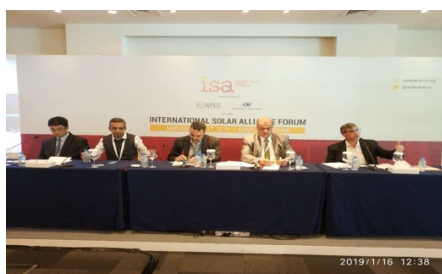
Technical panel on solar e-mobility and storage – 16 January 2019