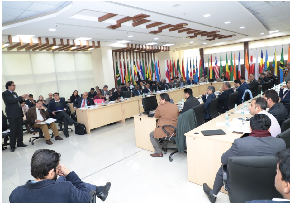
Stakeholders presenting their point of view during the meeting!

While discussing the the first programme of the ISA which is Scaling Solar Applications in Agricultural Use, apart from classification of pumps, and specifications based on demand, stakeholders showed interest in knowing the about the quantity, timeline for commissioning, and about the commercial cycle that would be set up for different batch quantities, along with the other nuances of the impending RFP. DG ISA emphasized on the role of ISA in strengthening the backward and forward linkages. Stakeholders also indicated at the IOT, in solar sector and how matching the solar technologies can benefit ..