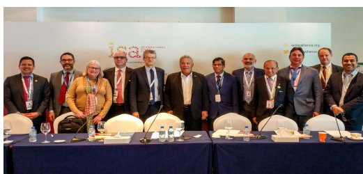
Technical panel discussion on capacity-building, research and technology transfer in ISA Member countries, 16 January 2019.