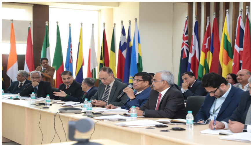
DG, ISA Addressing the Stakeholders from Industry and representatives of Member countries