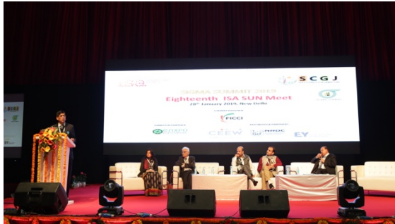
DG ISA ADDRESSING THE SUNMEET