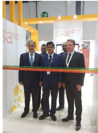
ISA ministerial plenary, WFES, 2019 Abu Dhabi