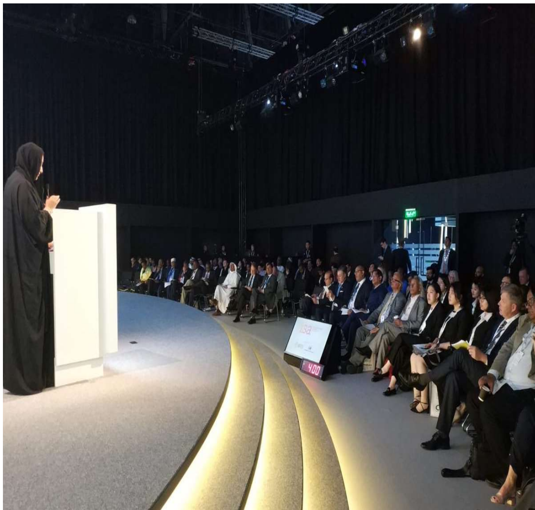
Ministerial Plenary in session